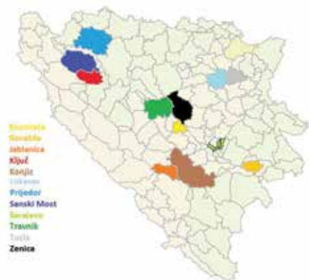
Figure 1. Sampling locations in territory of Bosnia and Herzegovina.

Importance of chlamydiosis is also zoonotical. Several types of Chlamydiales can be transmitted from animals to humans. Most often it is: Cp. psittaci , Cp. abortus and Cp. felis . Humans infected with Cp. psittaci may result in symptoms similar like atypical pneumonia, sometimes with complications like endocarditis,